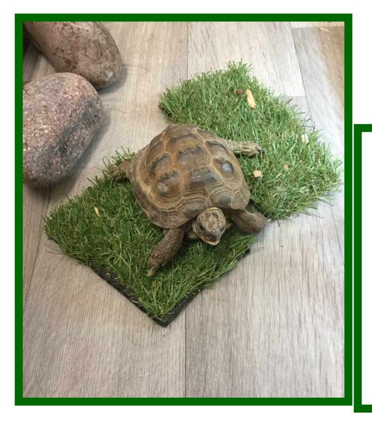
We have Harry the tortoise in our school. You will learn how to look after him and how we take care of him.